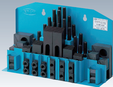
In metal case (with storage case)