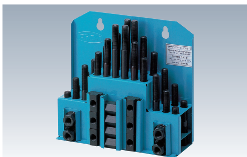
In Metal Case (With Storage Case)